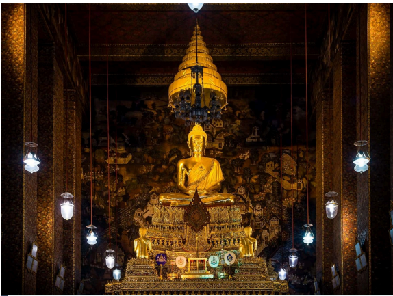
Asiatique The Riverfront